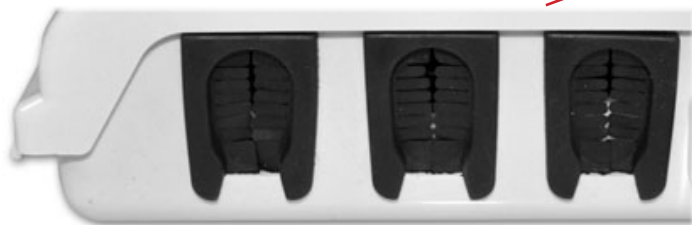
Three entry ports.